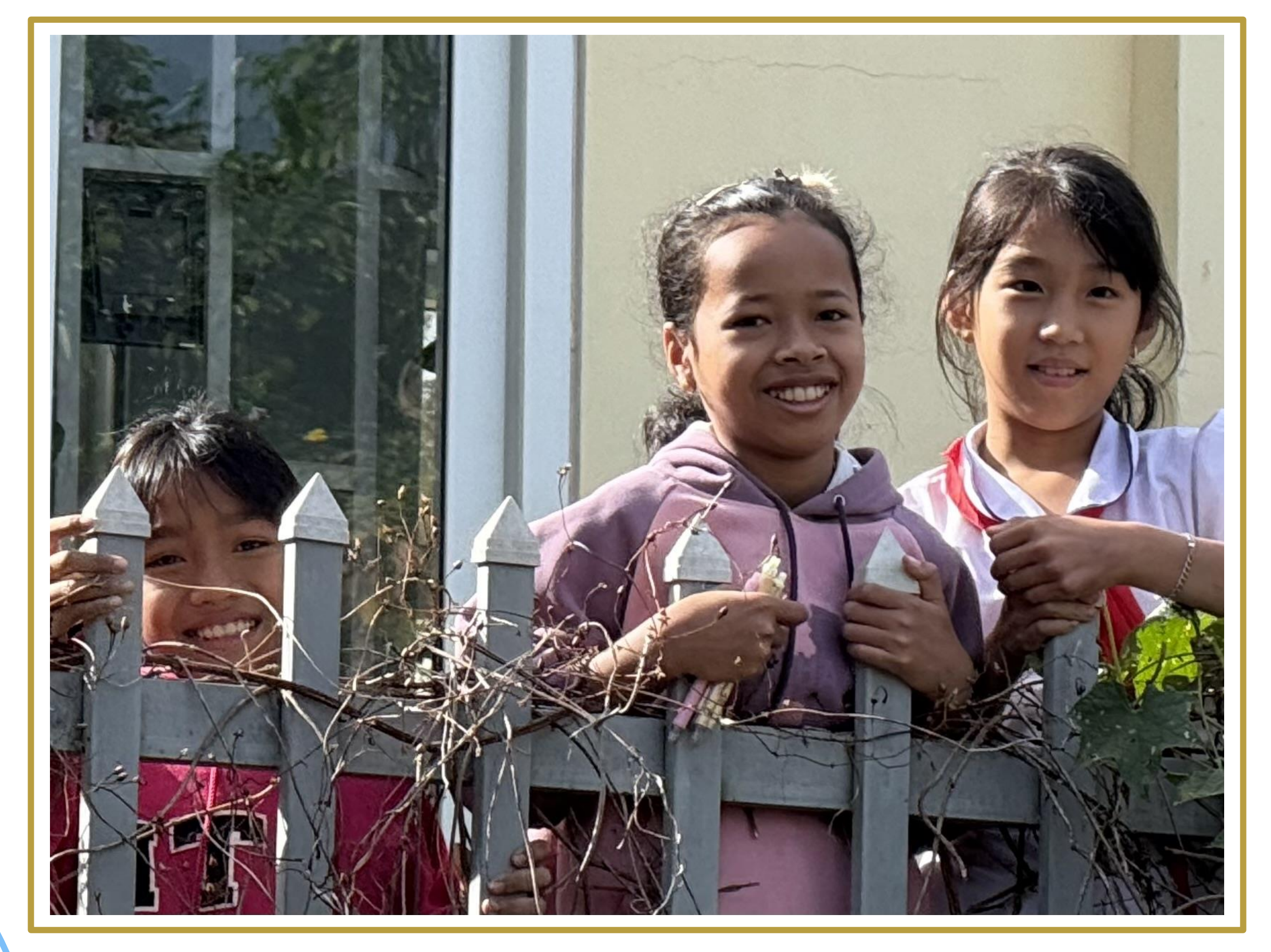
In support of underserved children and at-risk women in Vietnam